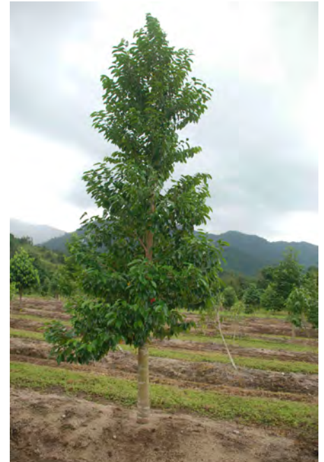
Fig 2: Tree with appropriate form