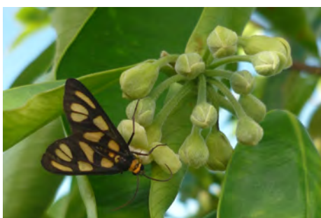
Primary Pollinator: Ceryx sphenodes