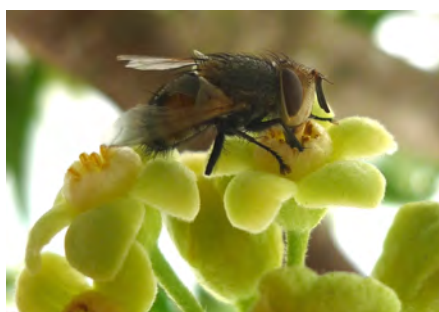
Pollinator: Calliphoridae Fly