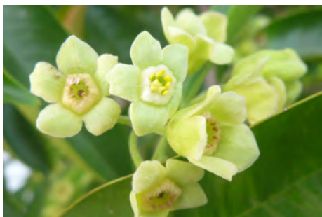
Aquilaria crassna flowers