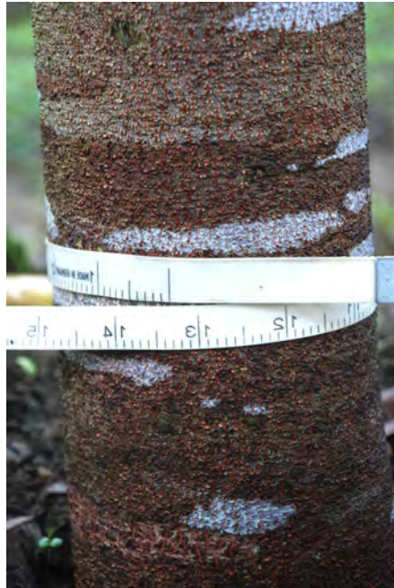
Fig 1: Trunk Basal Diameter

The draft has been completed as it is available to those growers that have signed the Grower Agreement with Wescorp Agarwood. Please remember this is a confidential document only available to our Growers. It cannot be copied or reproduced. This manual will be updated continually with Grower input and discoveries.