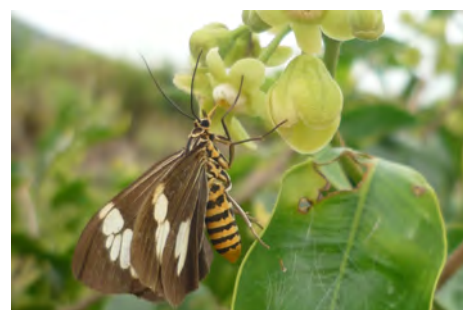
Primary Pollinator: Nyctemera amicus