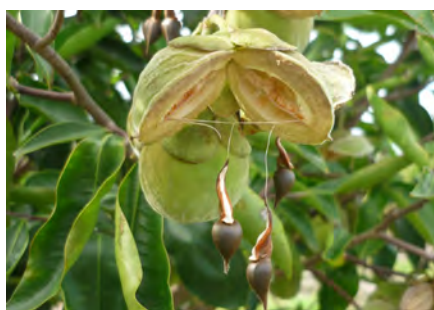
Aquilaria crassna fruit & seeds